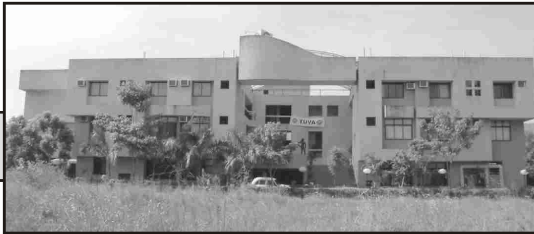
The YUVA Centre